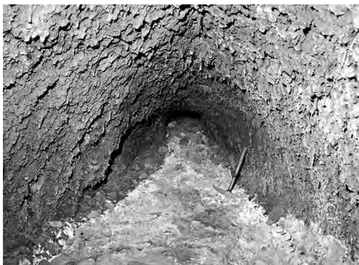
Figure 4: View looking north from the cave entrance.

As well as the cave, the main dyke also has a drained hollow vertical pipe at its southern end – this has been broken into by the quarry operation and we found the upper part lying on its side 20 m to the NE (see inset map, Figure 3). This pipe had spatter and dribble patterns on its inside walls (Figure 6). Elsewhere in the quarry there are intrusive pipes and smaller fingers of basalt that have pushed up through the loose scoria. Several of these have drained back after the outside had solidified so as to leave a hollow core, some with lava drips. Probably the most distinctive are conical “witch’s hat” structures (Figure 7).