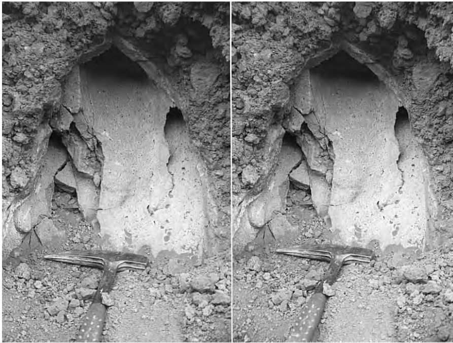
Figure 7: A conical “witch’s hat” formed by a finger of lava that intruded the loose scoria, then drained back to leave a hollow core. Stereopair.

The area has other features of both geological and historic interest and warrants preservation. For example, the underside of the lava flow capping the scoria is exposed in several places and shows a wrinkled “belly” with fragments of the loose scoria stuck to it. The surrounding “stony rises” have some particularly elegant and distinctive dry-stone walls that were constructed by early European settlers.