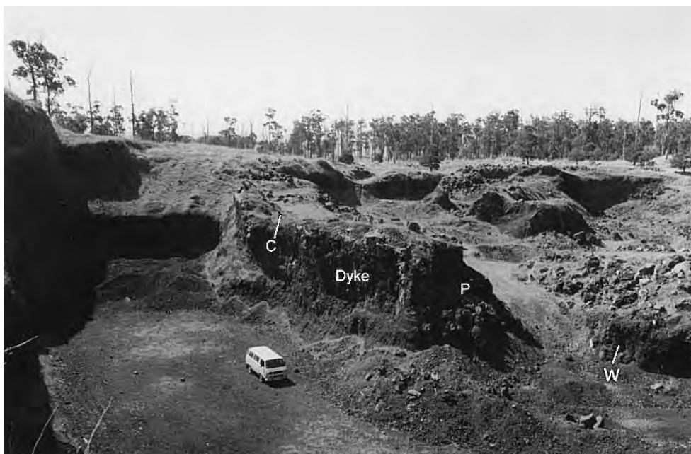
Figure 2: View of Mt. Fyans Quarry, looking north towards the large dyke. C = cave, P = pipe, W = witch's hats.

scoria has been intruded by two large basalt dykes up to 12 m across (which would have fed the lava cap) and a number of smaller pipe or finger-like basalt bodies, some of which have been partly drained to leave small cavities. Figure 2 is a view of the quarry and the main