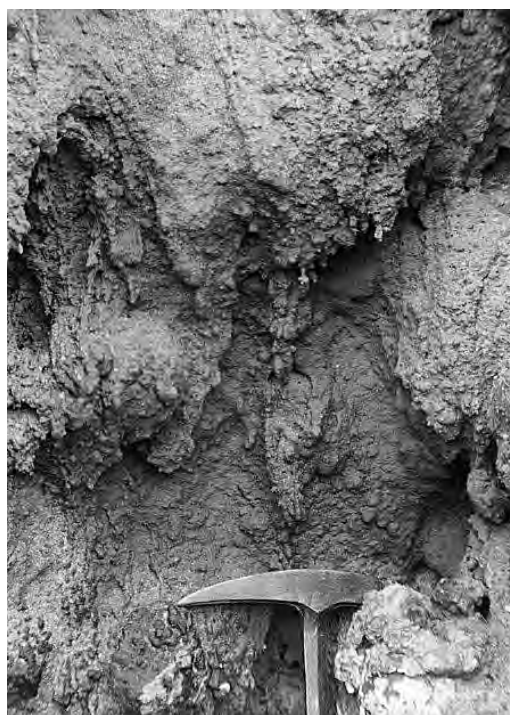
Figure 6: Spatter and drips in a vertical pipe.