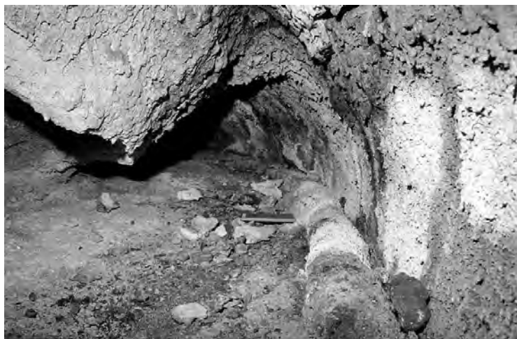
Figure 5: Looking south from section X4. Note the small rolled bench against the foot of the wall and the pale patches on the wall. Notebook is 18 cm long.