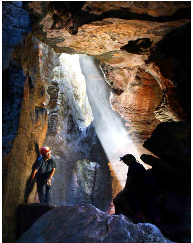
Daylight hole, Golden Arches, Bullita Cave.

The editor, authors, and the Judbarra / Gregory Karst Research SIG, are in debt to the management and