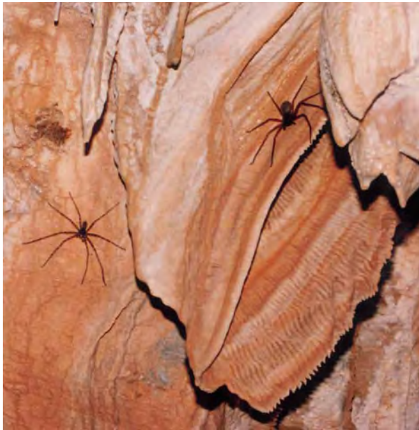
Spiders on speleothems.

lower than in other tropical karsts of northern Australia, where humidity is saturated, or nearly so, within a few metres of cave entrances. However, high humidities do occur near the sumps. Numerous tree roots and pools left from the seasonal flooding provide additional habitat.