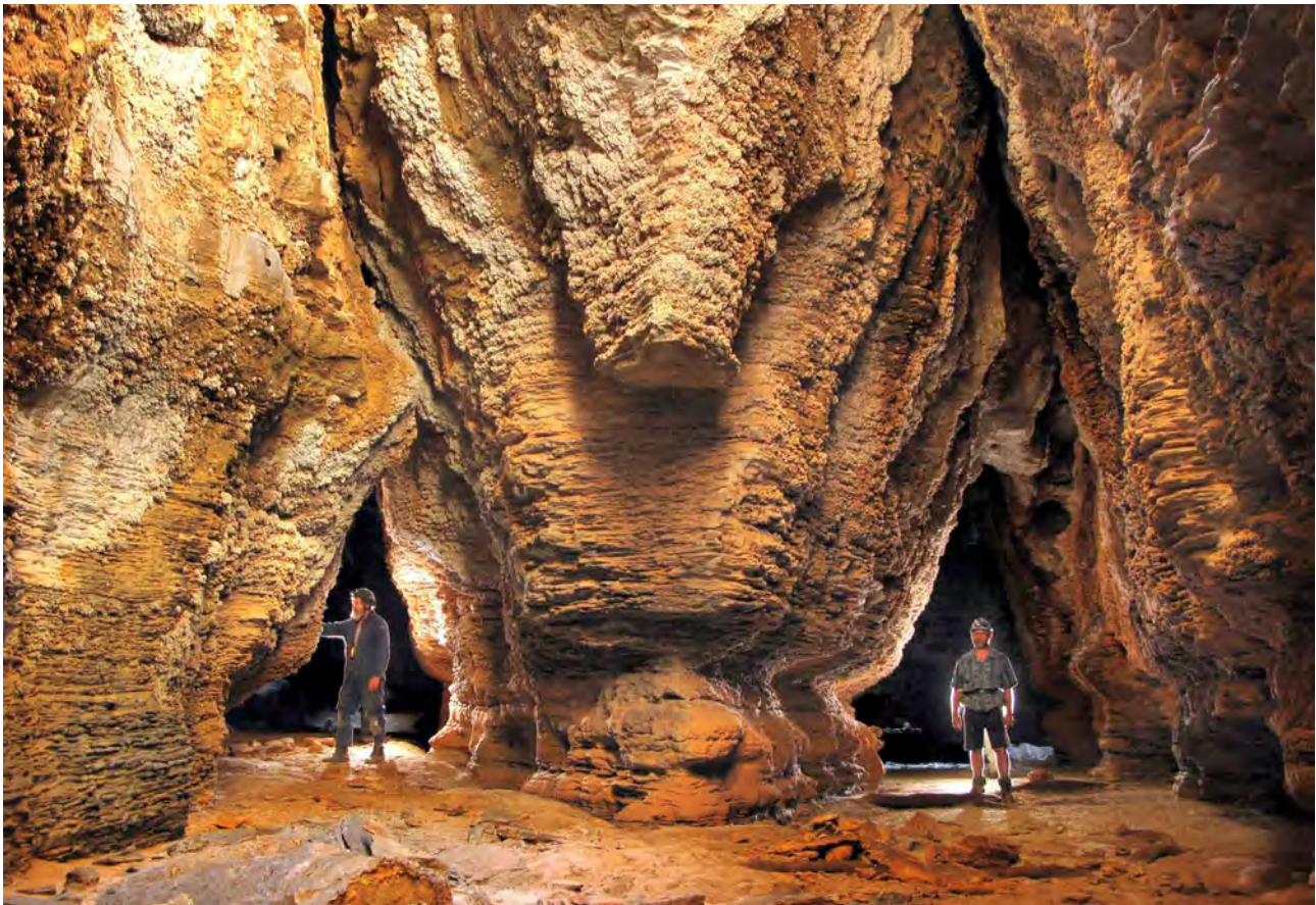
Below: Passage junction, The Frontyard, Bullita Cave system. [A. Pryke]