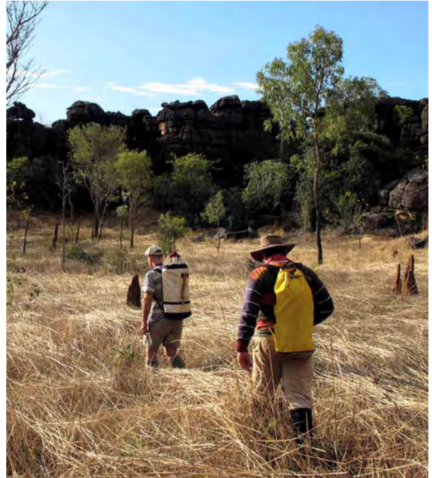
Exploring in the Spring Creek karst area.

Systematic exploration of the caves began with the Operation Raleigh expedition in 1990. Initial exploration was by two clubs: the Top End Speleological Society (TESS), based in Darwin, and the Canberra Speleological Society (CSS); however the work soon became concentrated into a single two-week expedition each year involving members of many societies within the Australian Speleological Federation (ASF).