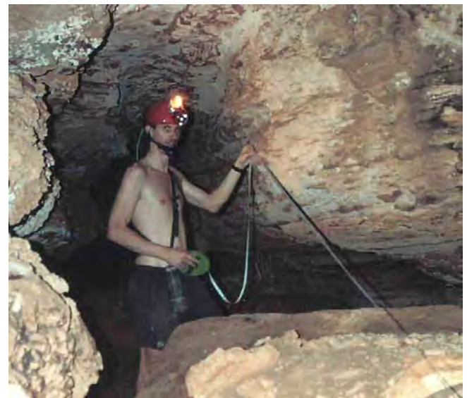
Surveying in the Dingo Cave system, 1993.

Traditional Owners of the Judbarra / Gregory National Park (previously Gregory National Park), who granted permission to perform the mapping and scientific investigations and to publish the papers in this issue.