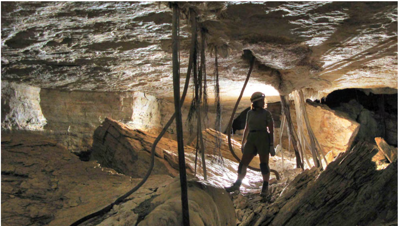
Below: Shale-bed passage with tree roots, Hole-In-One Cave, Spring Creek. [A. Pryke]