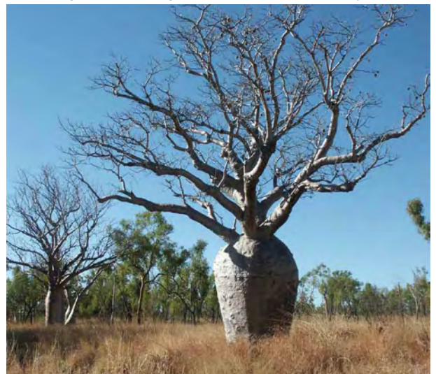
A Boab tree, Adansonia gregorii , in open savanna woodland.

The Judbarra / Gregory Karst Research Special Interest Group was formed within the ASF in 2005 to formalise the activities of the group. The group's logo is inspired by the distinctive, deciduous Boab trees that grow above the maze cave systems.