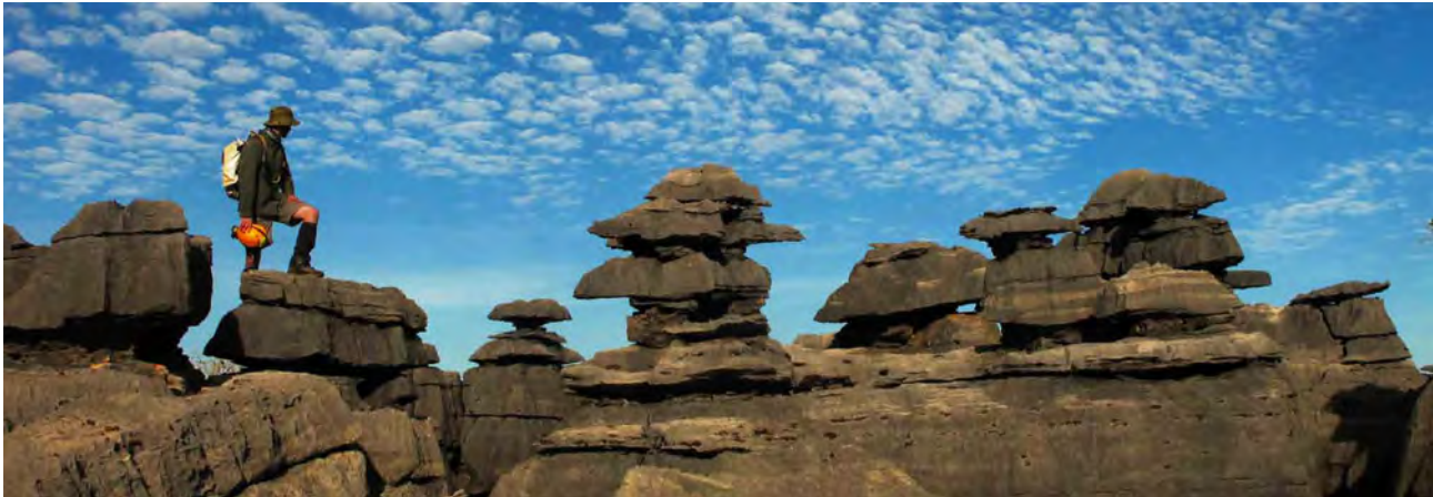
Above: Karrenfield on the Mostly Harmless bluff, Spring Creek karst.