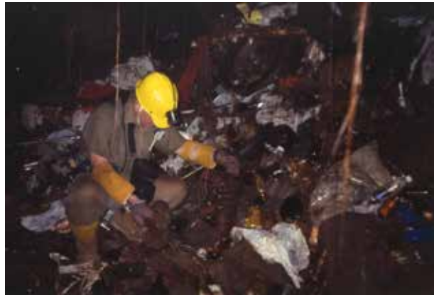
Bill campaigned against the dumping of rubbish in lava caves – under a Kaumana garbage puka.