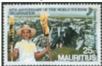
A side entrance to Caverne Patate featured on a Mauritian stamp of 1985