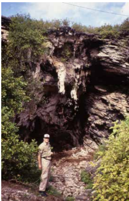
Bill at the entrance to Caverne Patate shown on the 1985 stamp.

Bill arrived in Mauritius on 12 May 1995, having just visited Kenya to check out the possibility of holding a symposium there for the Volcanic Caves Commission. I showed him some lava caves within minutes of the airport and next day we flew to Rodrigues (the second island of Mauritius, 650 km to the north-east). There I was able to take him to the very spot shown on the 1985 stamp.