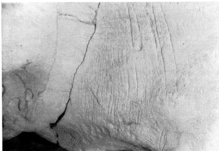
Figure 2. Second group of markings. Incisions and scratchings.