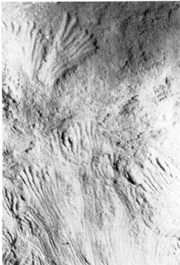
Figure 6. Marks made by tourist disfiguring the art gallery.