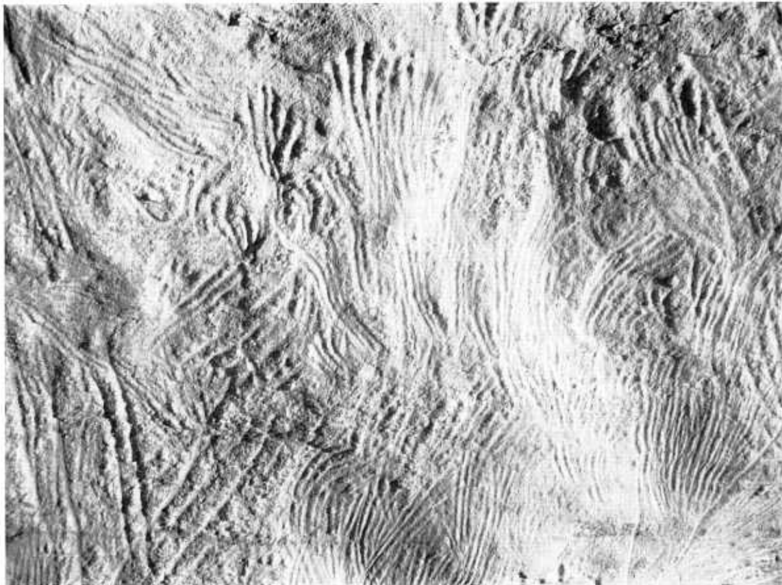
Figure 1. First group of markings. Drawn with fingers in soft clay.